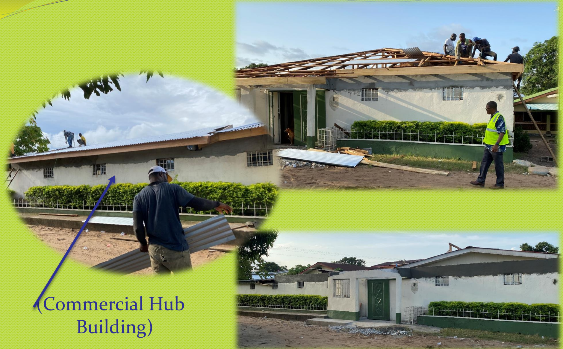
(Commercial Hub Building)