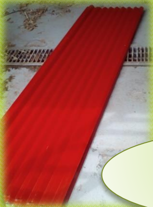
Back Wall Extension