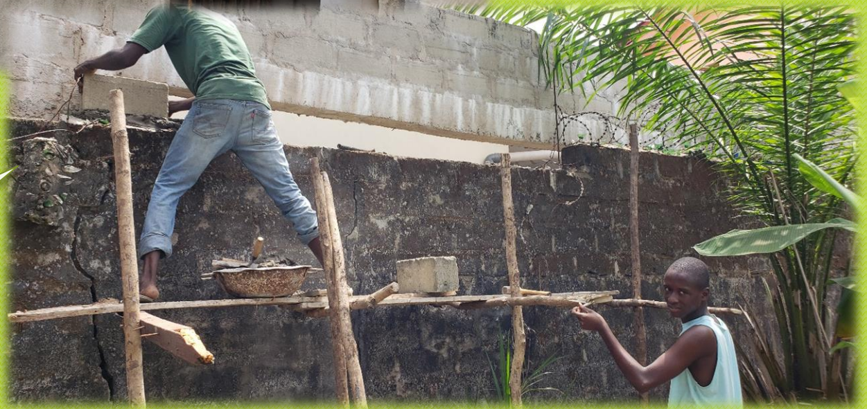
Outside Wall Extension