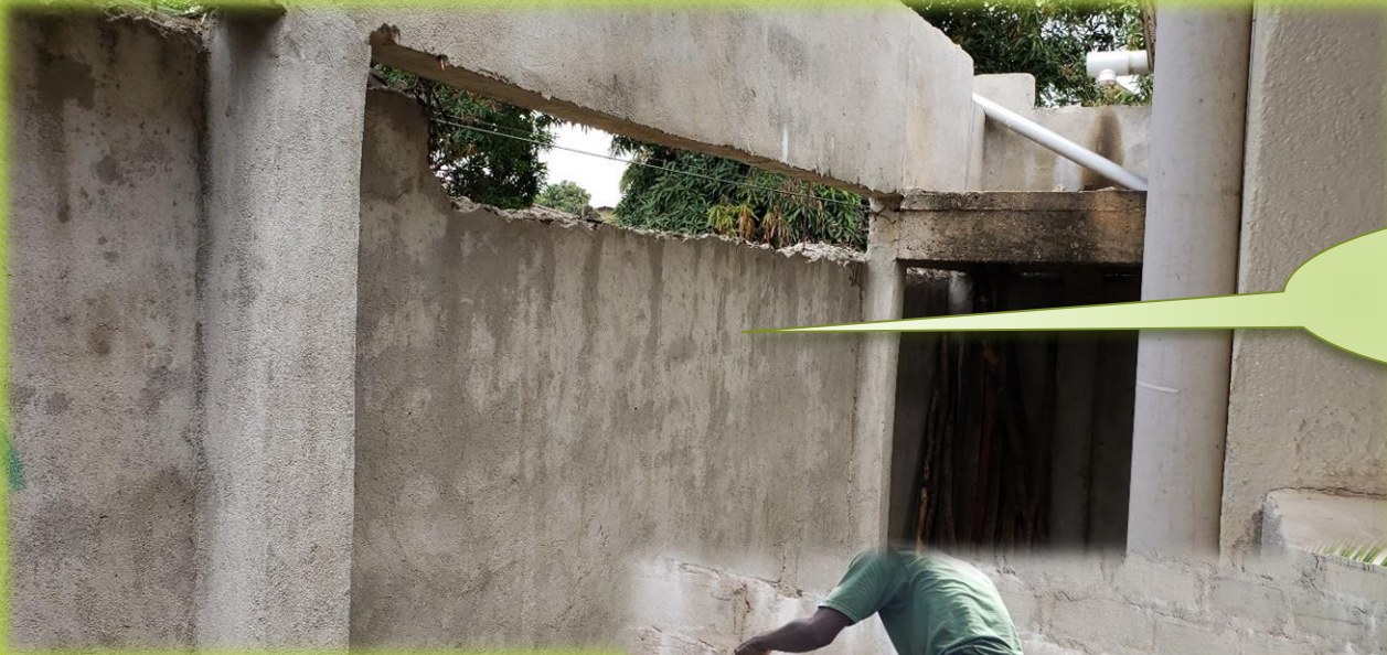
Inside completed Wall Extension