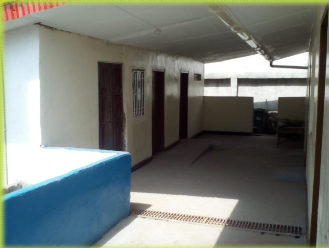
Closure of Back of Annex Area