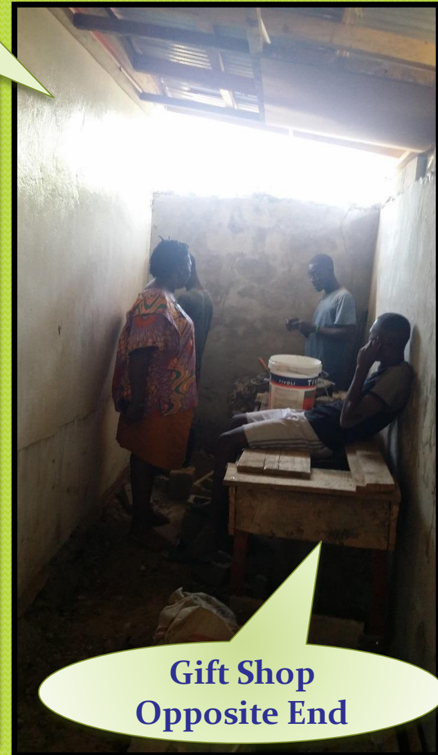
Gift Shop Opposite End