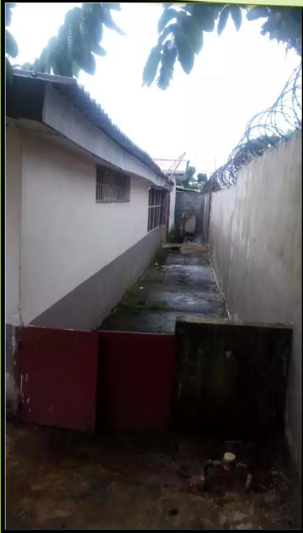
My Heart's Appeal, Inc.