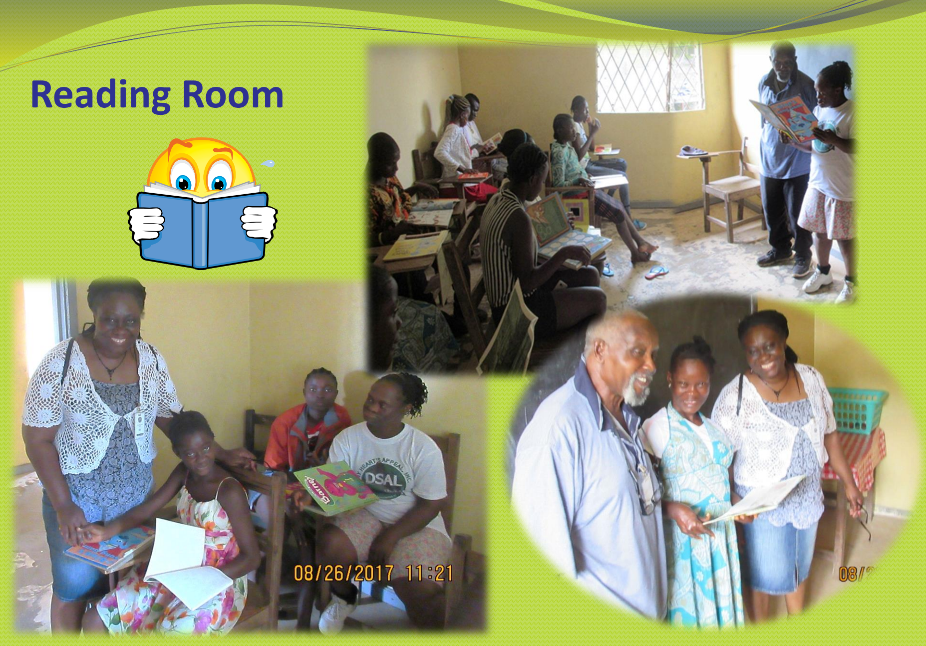
My Heart's Appeal, Inc.