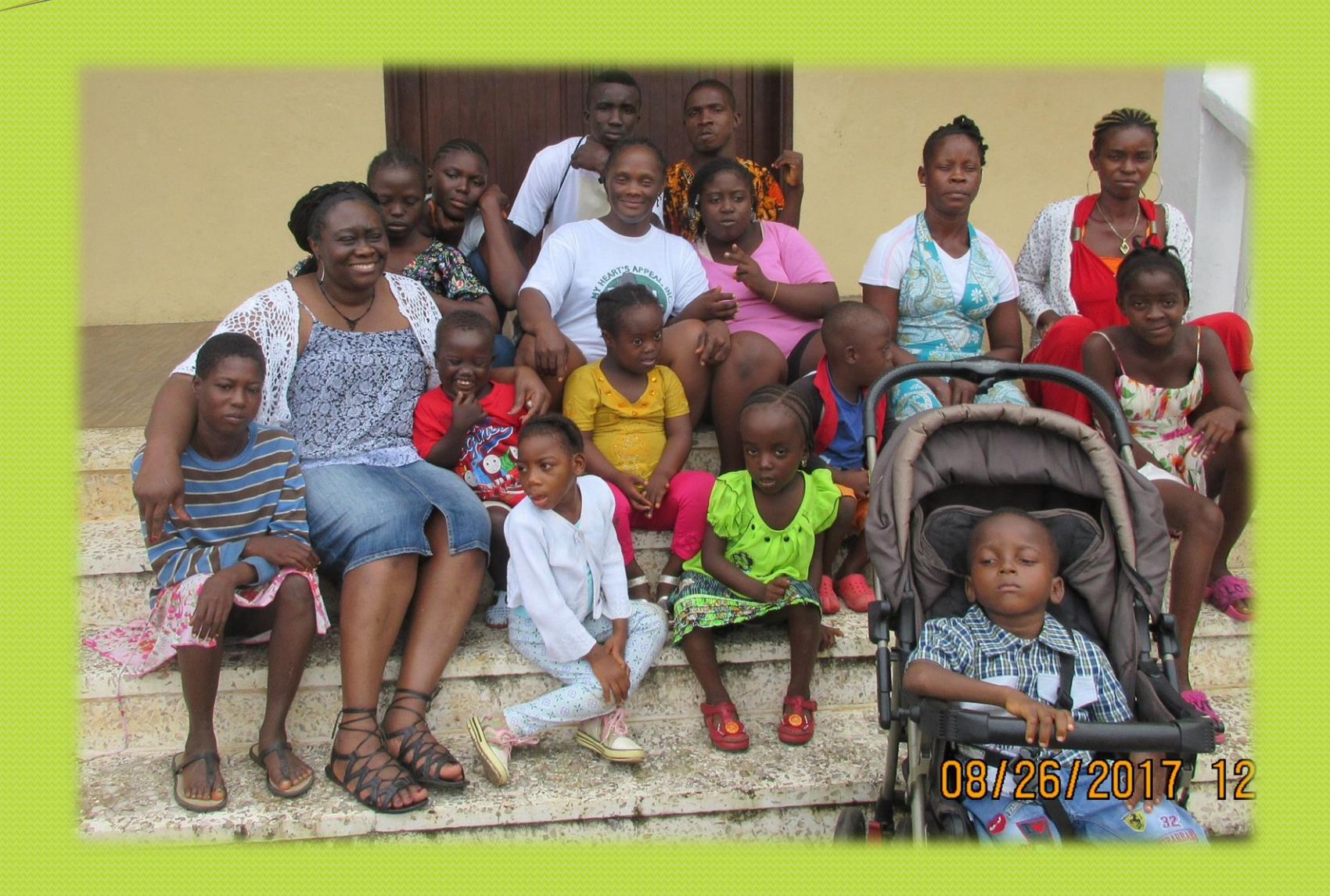
My Heart's Appeal, Inc.