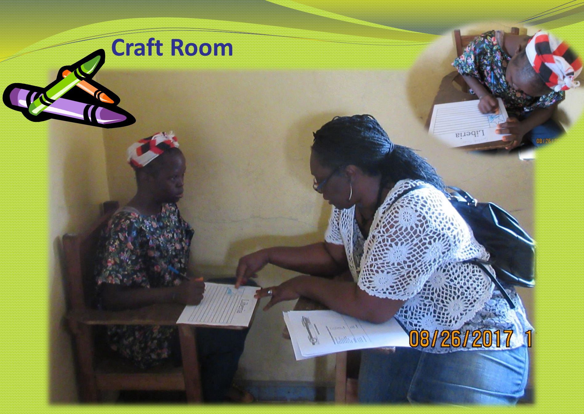
My Heart's Appeal, Inc.