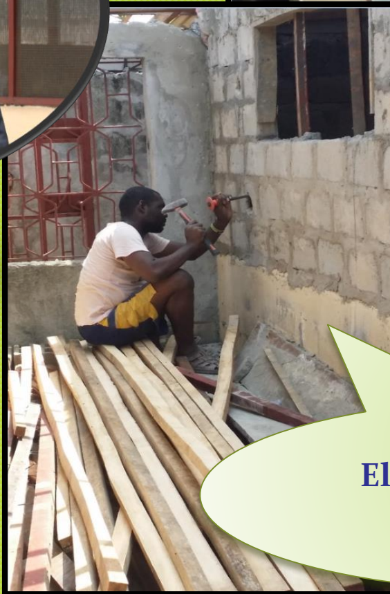
Electrical & Brick Wall Extension