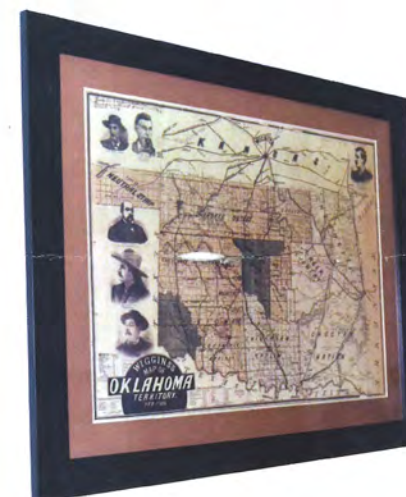
Framed Oklahoma Territory Map

Wyman Frame, through a partnership with the Oklahoma History Center, is framing images through our state's history. From maps, to historical images, to posters, the skilled hands at Wyman Frame can help history come to life! Download our State Contract Catalog at WymanFrame.org to see more examples.