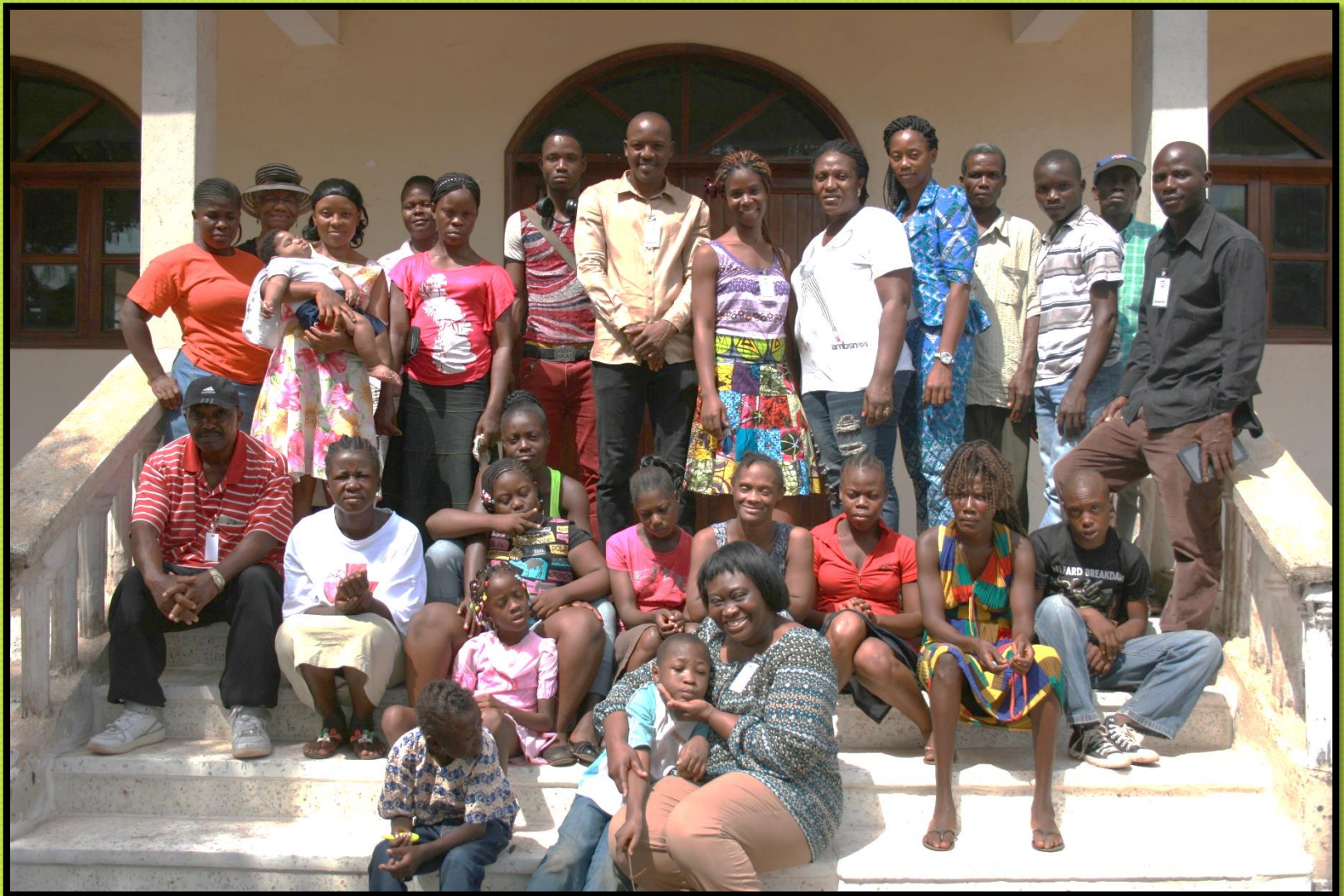
My Heart's Appeal, Inc.