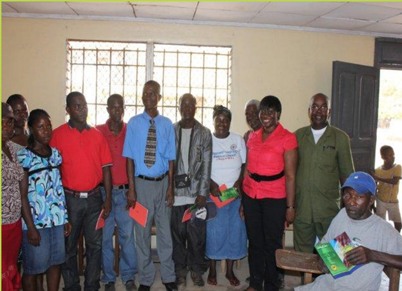
My Heart's Appeal, Inc.