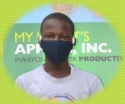
My Heart's Appeal, Inc.