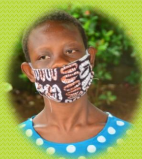
My Heart's Appeal, Inc.