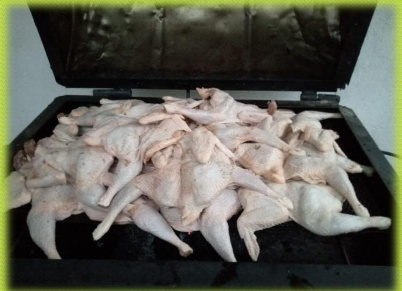
Chicken on the Grill