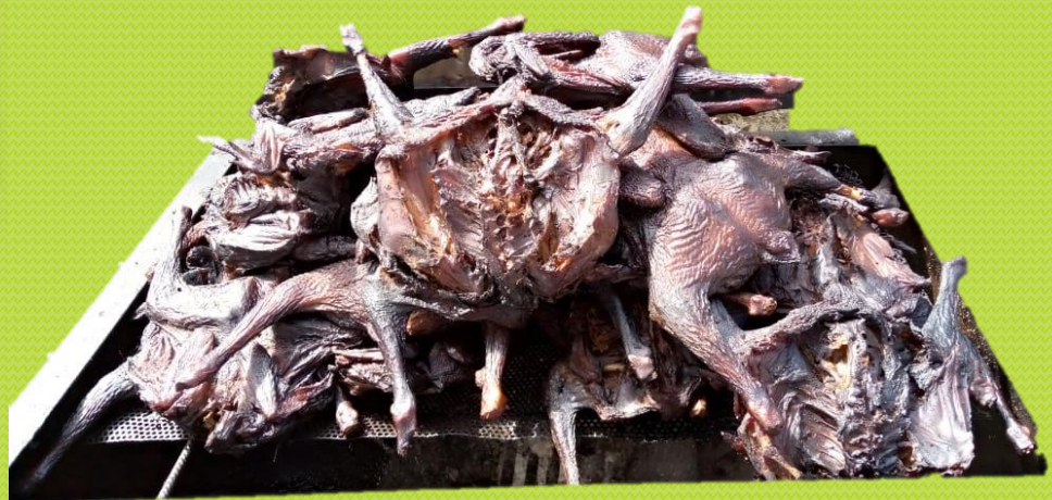
Preserved Dried Poultry