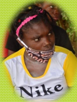
My Heart's Appeal, Inc.