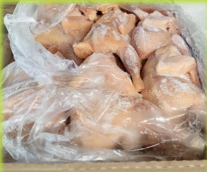
Frozen Whole Fresh Chicken