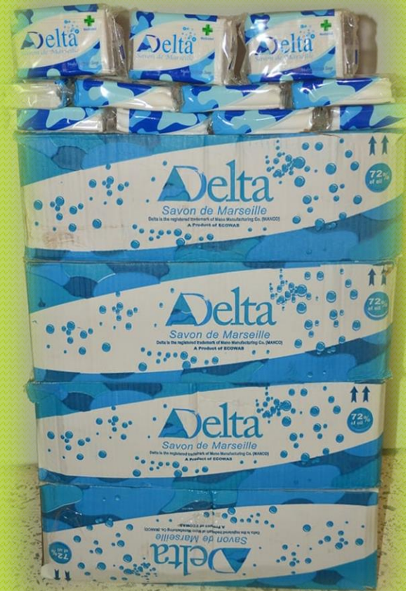
Antiseptic Bar Soap