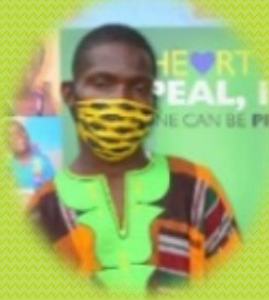
My Heart's Appeal, Inc.