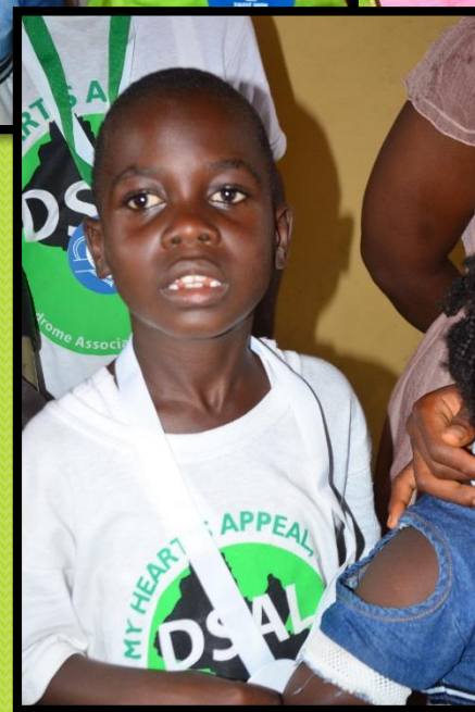
My Heart's Appeal, Inc.