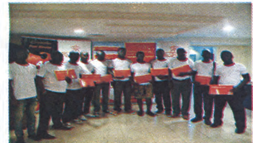
The winners with Cellcom CEO