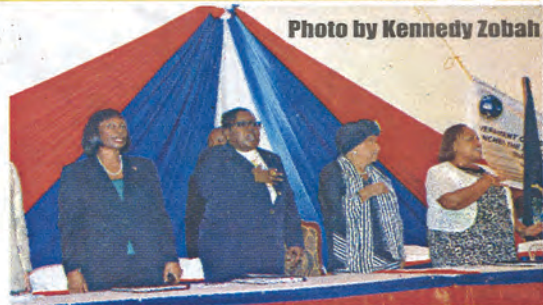
Acting Justice Minister Cllr. Barnes, Labour Minister Cllr. Lawson, President Sirleaf and Gender Minister Cassell at yesterday's occasion

Also speaking, United States Ambassador to Liberia, Debora Malac, expressed the US Government's