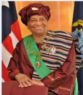
LIBERIANS CELEBRATE PRESIDENT ELLEN JOHNSON SIRLEAF'S 74TH BIRTHDAY IN GRAND STYLE