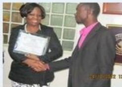
SINOE UNIVERSITY STUDENT ASSOCIATION HONORED NPA MANAGING DIRECTOR