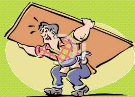
My Heart's Appeal, Inc.