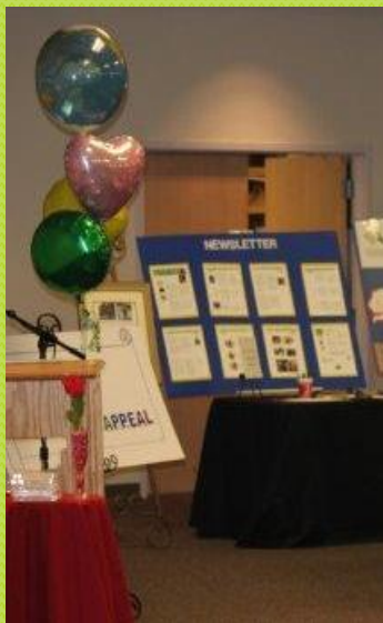
My Heart's Appeal, Inc.