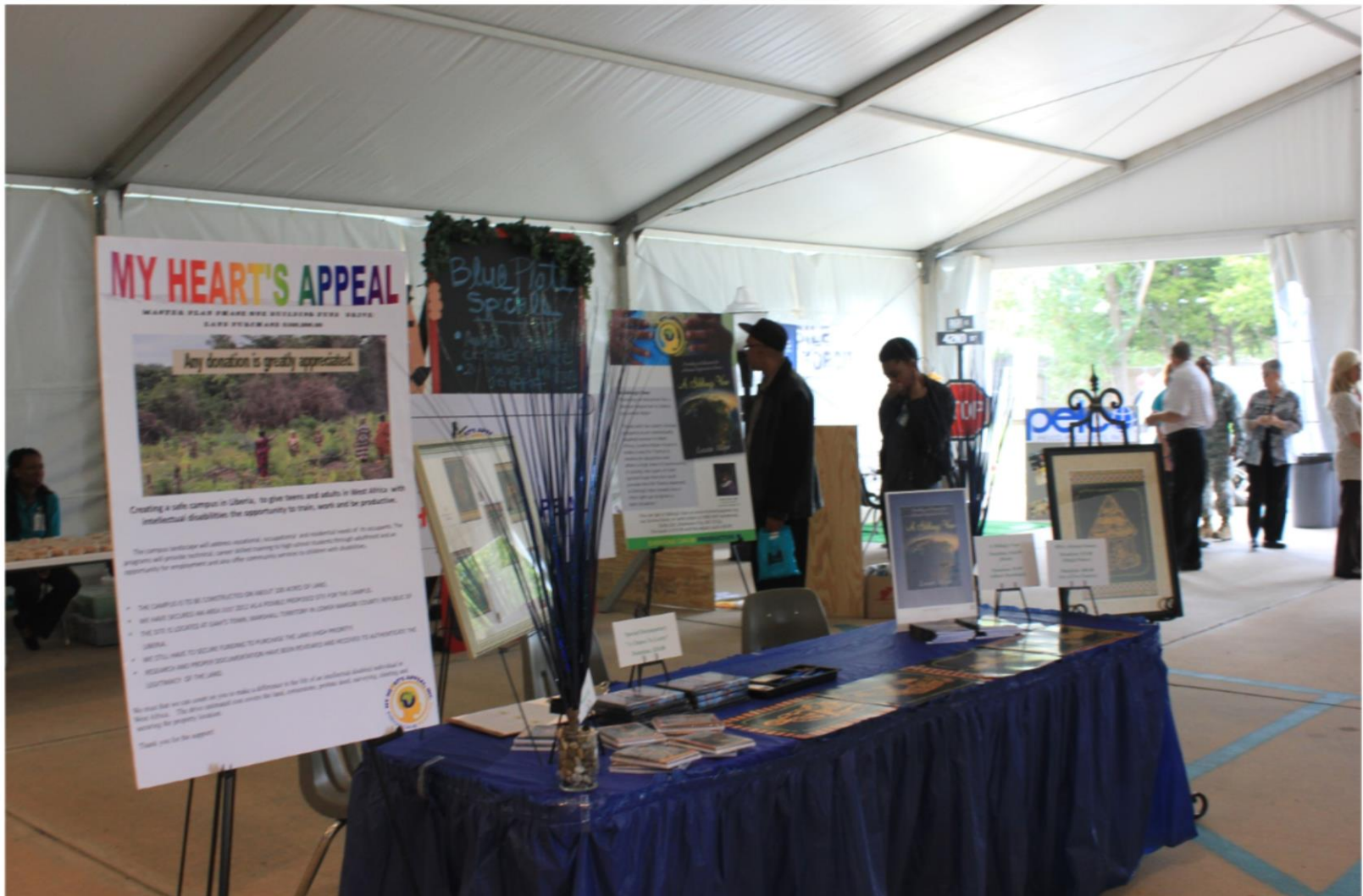
My Heart's Appeal, Inc.