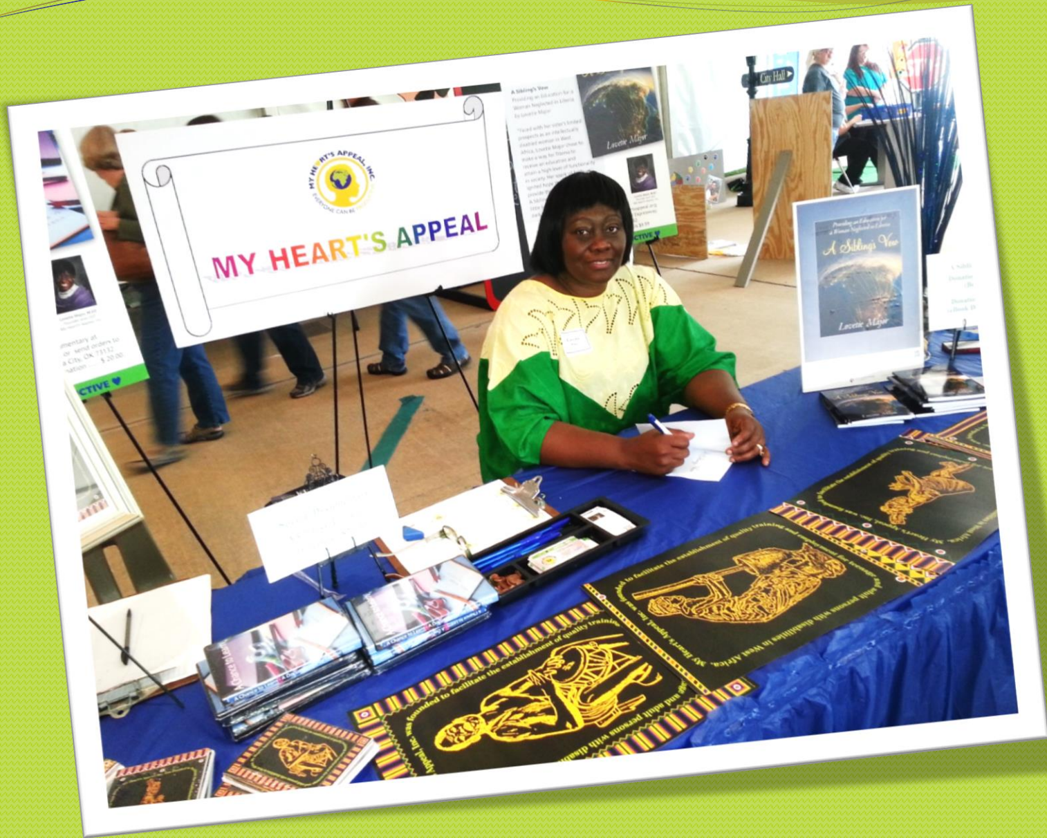
My Heart's Appeal, Inc.