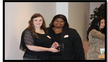
Lauren Weingart, Creative Photo Video