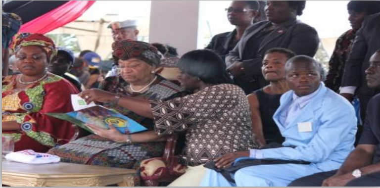
Liberian President Ellen Johnson Sirleaf enlightened on MHA Activities.