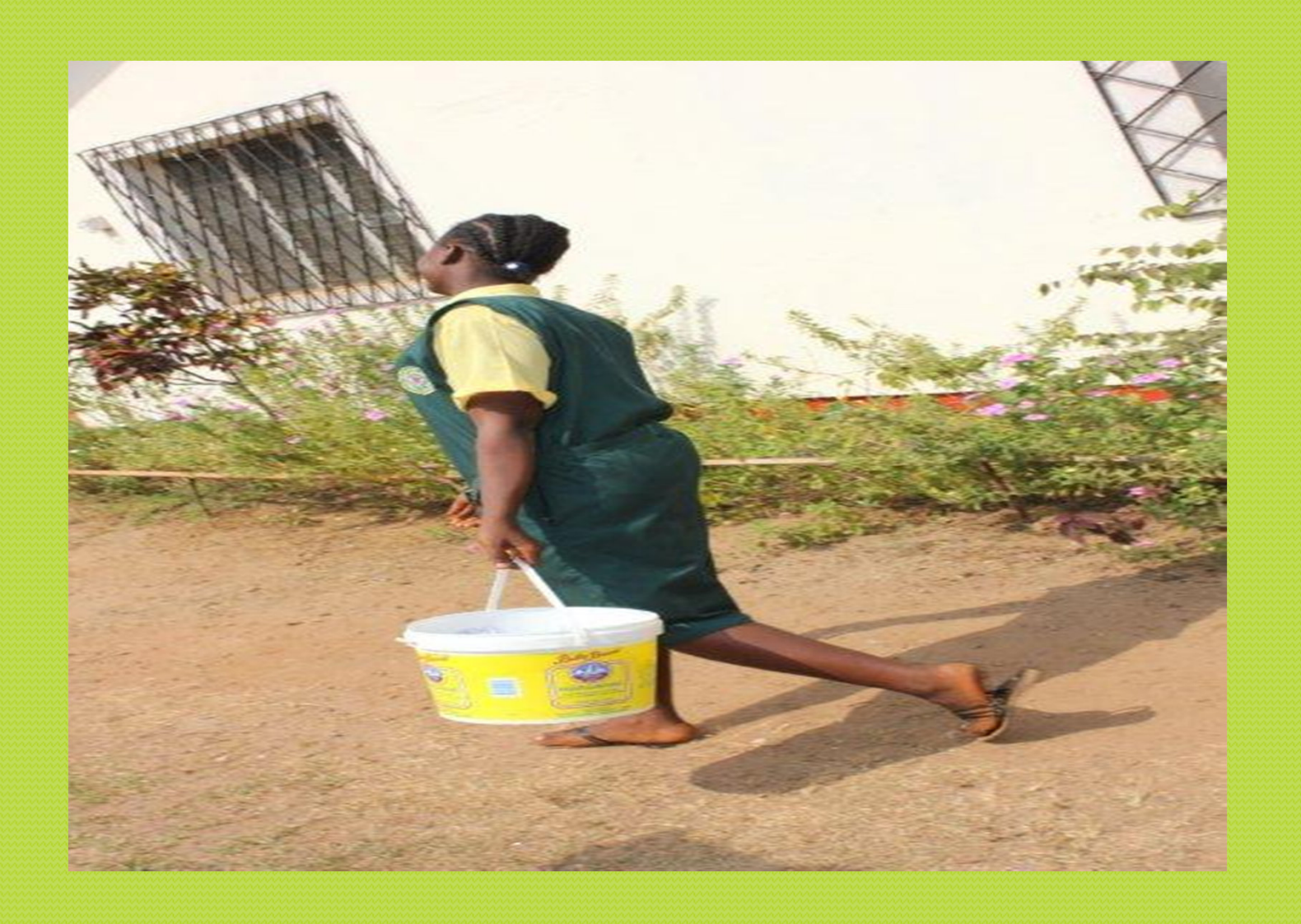
My Heart's Appeal, Inc.