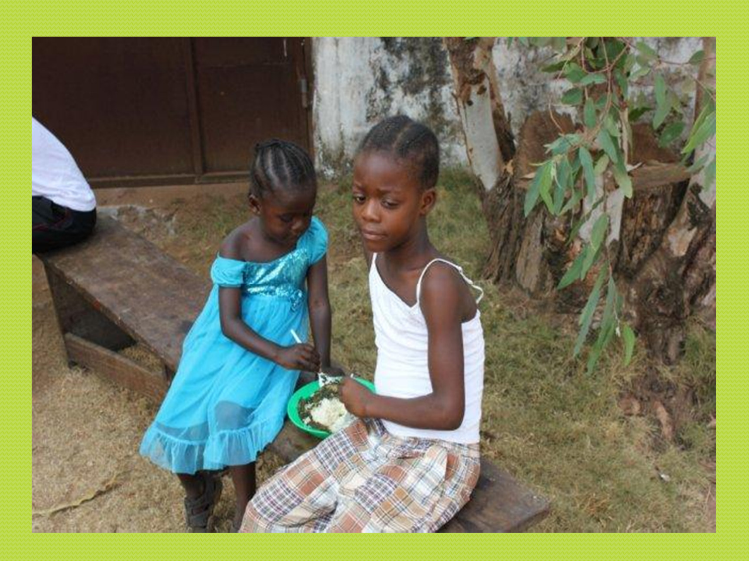
My Heart's Appeal, Inc.