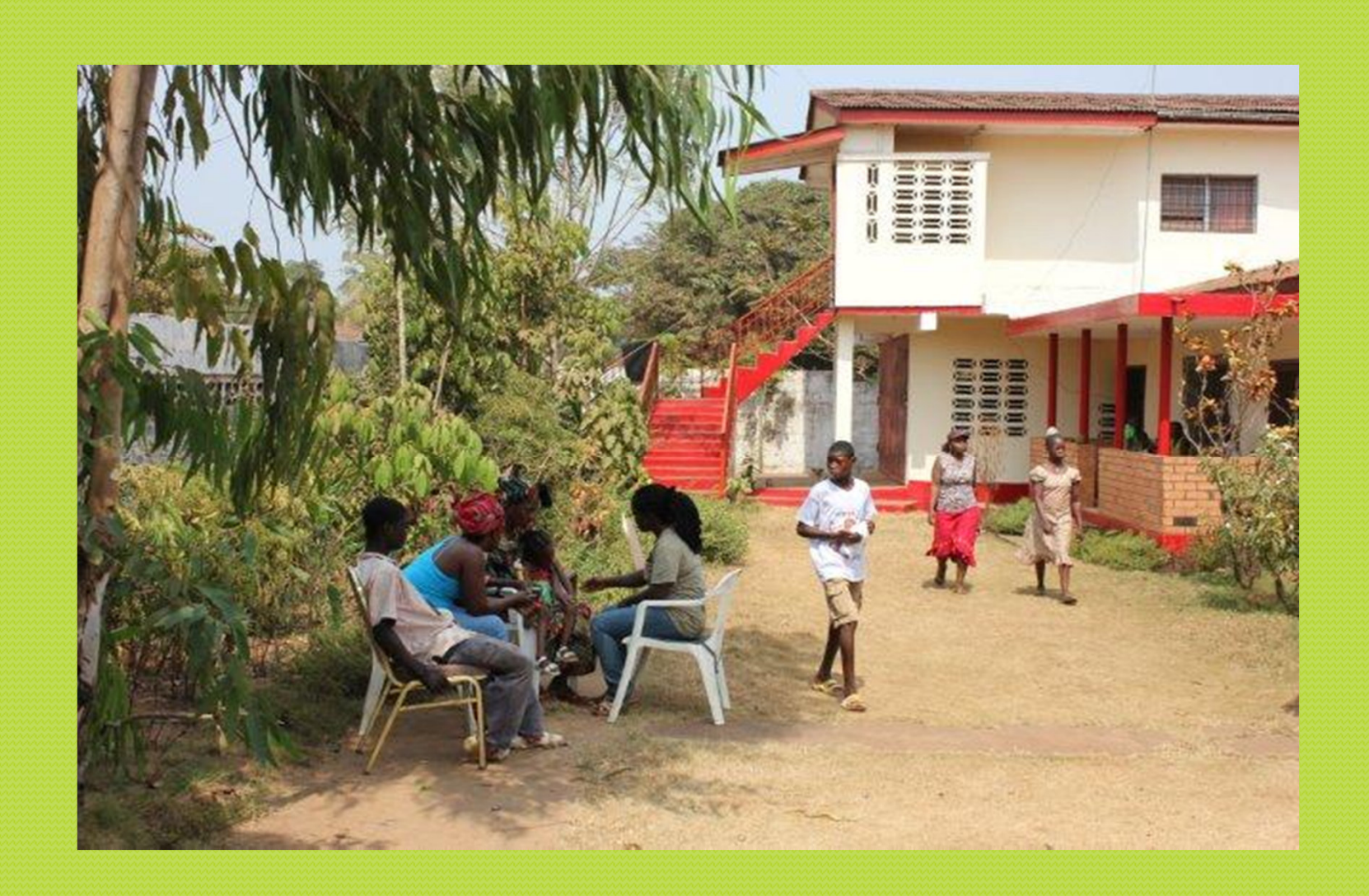
My Heart's Appeal, Inc.