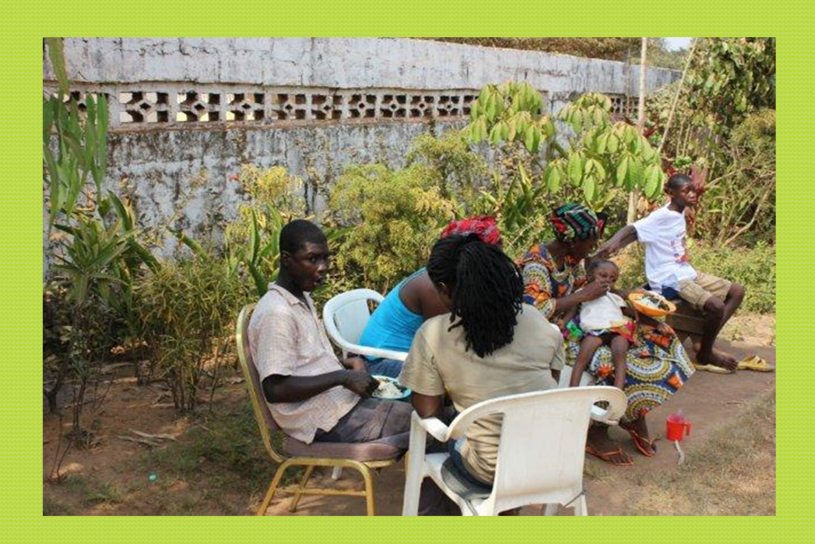
My Heart's Appeal, Inc.