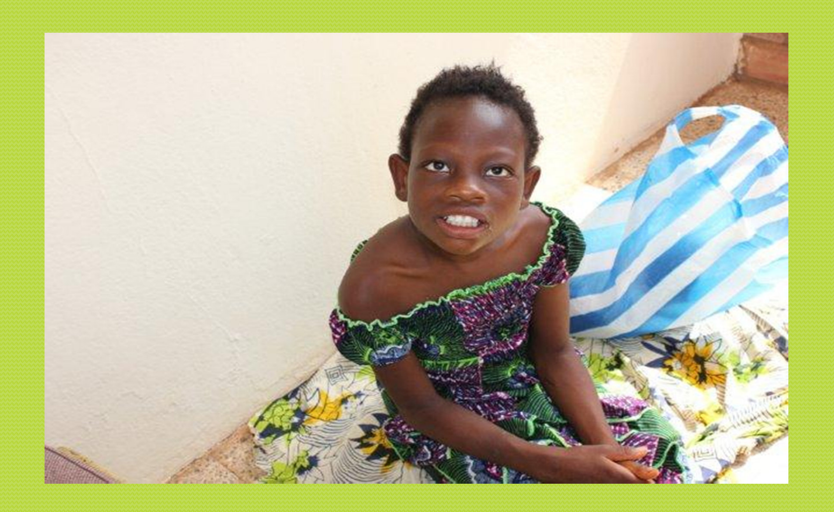
My Heart's Appeal, Inc.